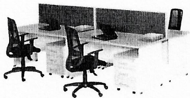
01 4-way cluster set

desks with 3 drawer mobile pedestals X 1 (Colour : Windsor Cherry/American cherry)