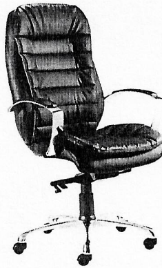
03 Pinnacle Highback Chair