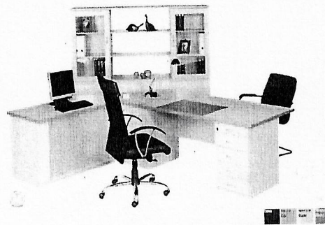
01 Executive Double Pedestal Desk with lockable roller door credenza and 90degrees Right hand side link top (Colour: Windsor Cherry) x 1